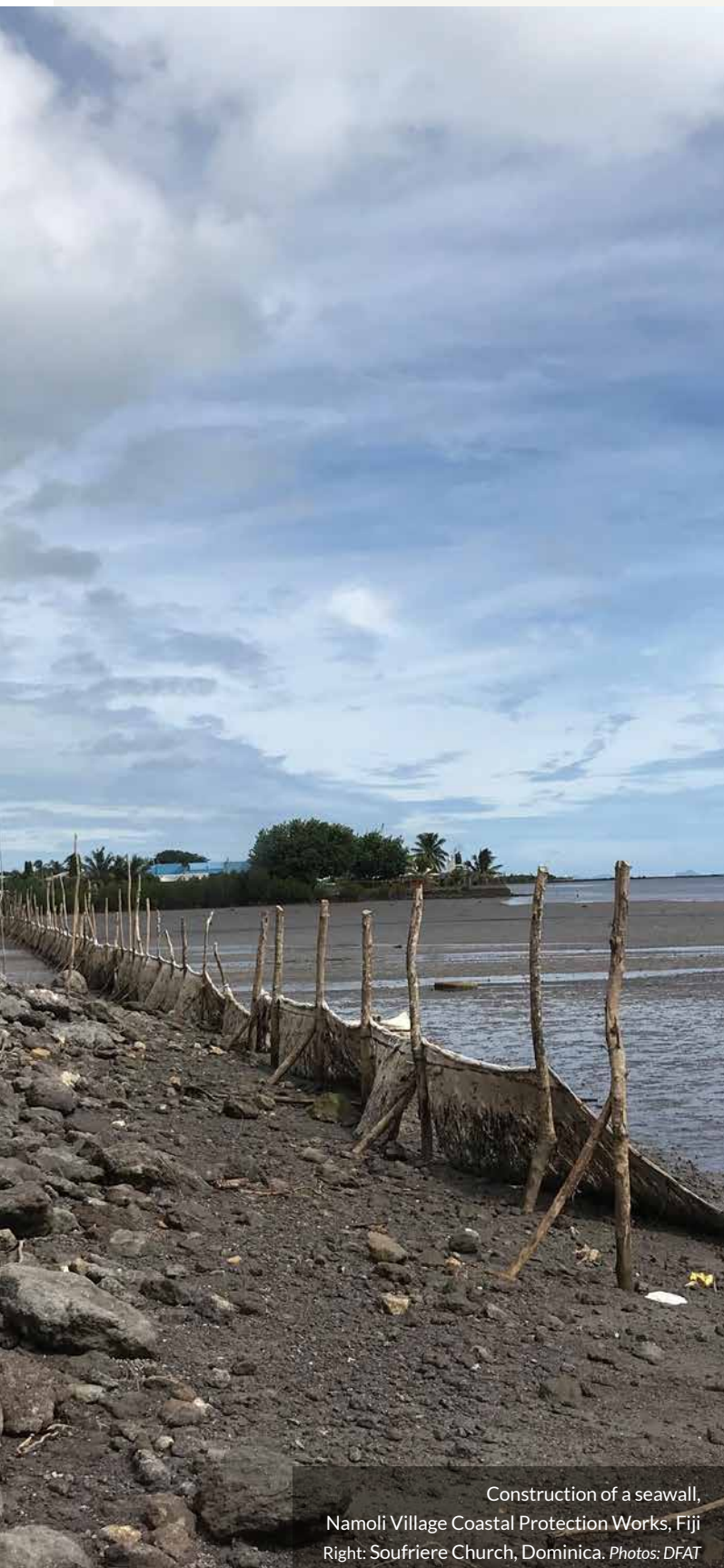
Construction of a seawall, Namoli Village Coastal Protection Works, Fiji Right: Soufriere Church, Dominica.

This partnership strategy outlines a holistic approach to deepening Ireland's relationships with SIDS, building on our diplomatic, bilateral, multilateral, and international development links, and fostering ever closer bonds between our peoples.