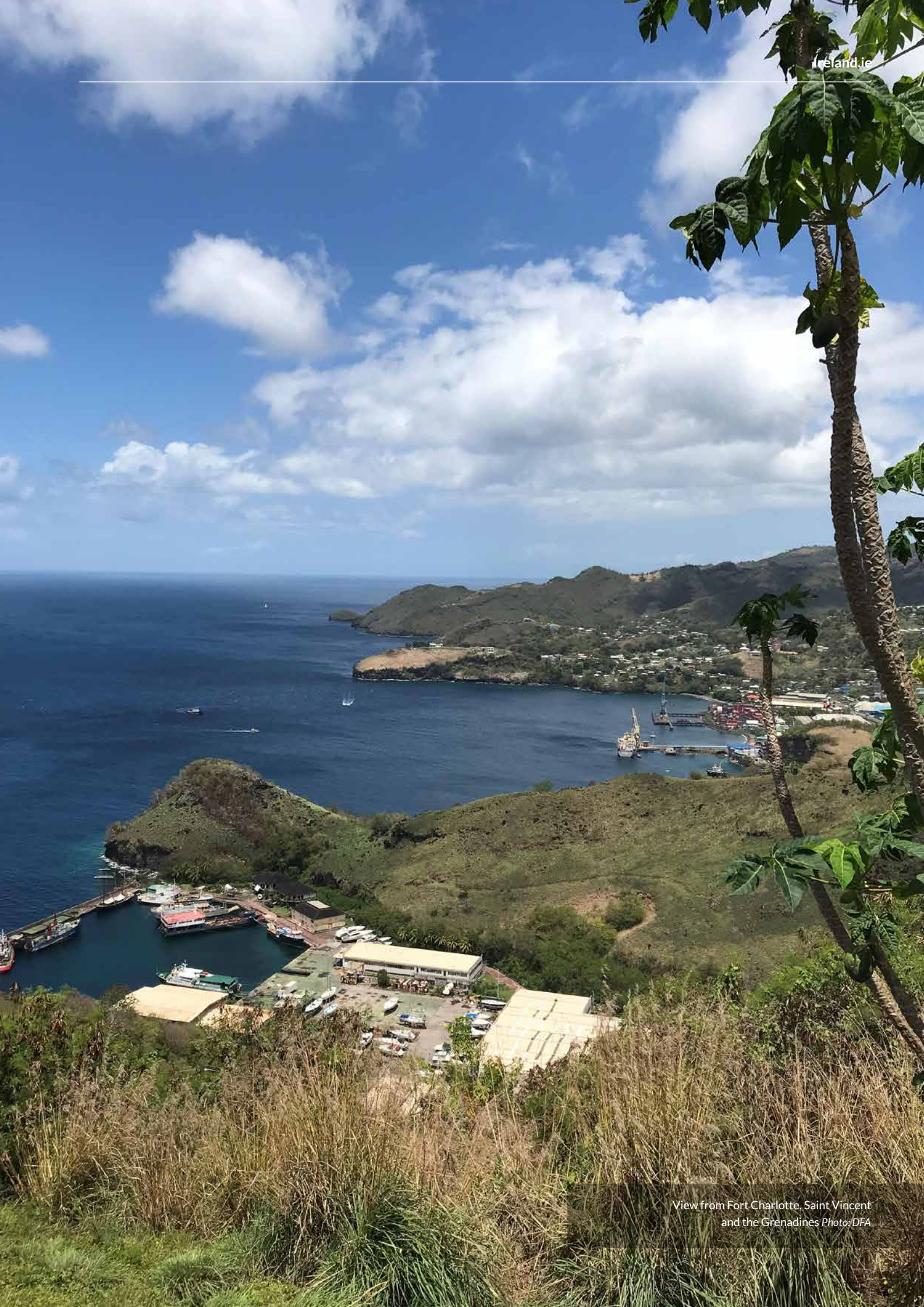
View from Fort Charlotte, Saint Vincent and the Grenadines