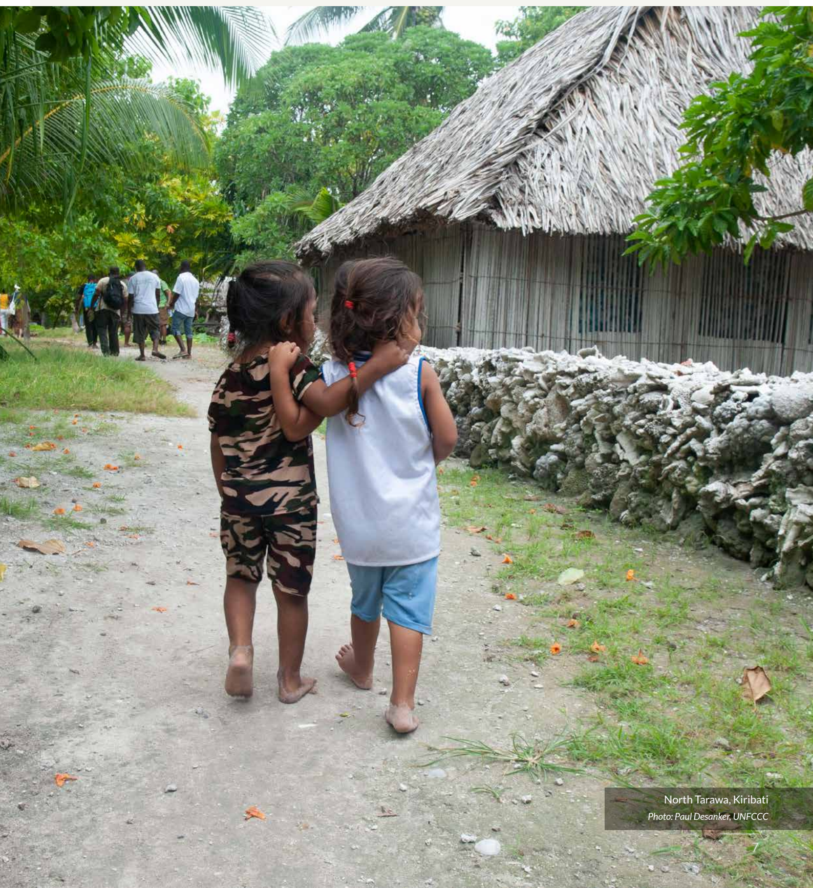
North Tarawa, Kiribati