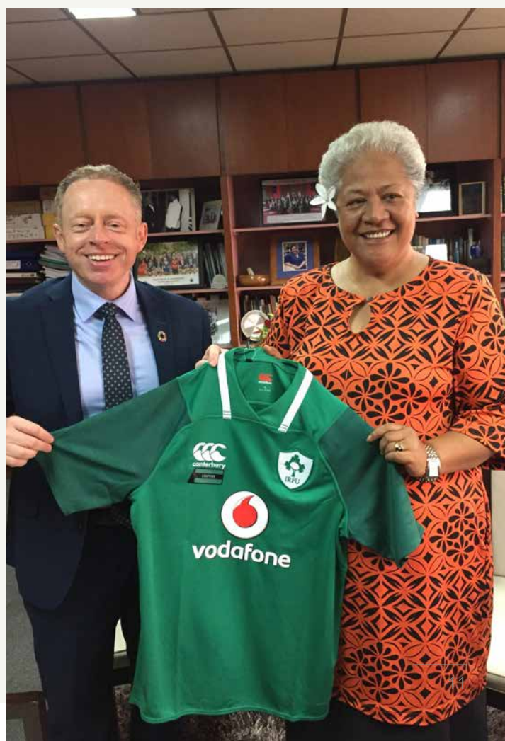
Below: Minister of State Cannon meets with Deputy Prime Minister of Samoa Fiame Naomi Mata'afa in Apia.