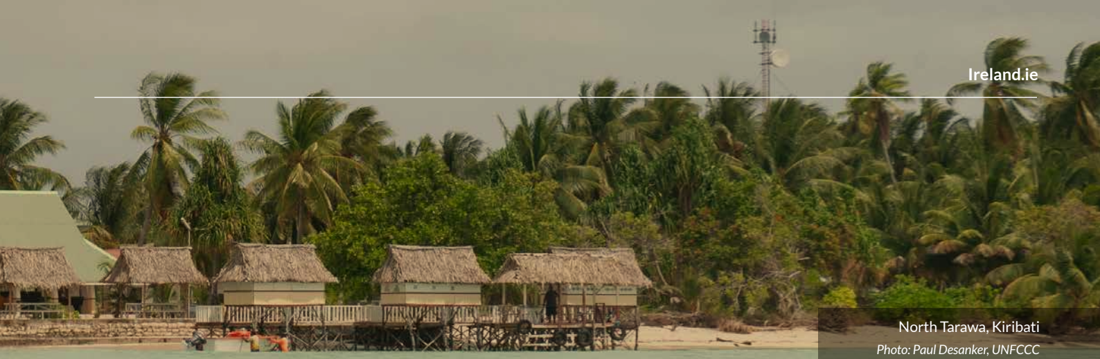
North Tarawa, Kiribati