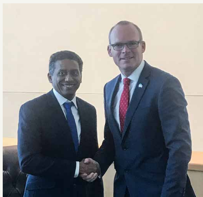
An Tánaiste Simon Coveney meets with President of Seychelles, H.E. Danny Faure, at the United Nations General Assembly, September 2018

This strategy is a statement of Ireland's friendship. It commits Ireland to supporting our fellow islanders in implementing the SAMOA Pathway (SIDS Accelerated Modalities of Action) and in achieving the Sustainable Development Goals, and to help mobilise the international community behind these efforts, in a spirit of mutual respect, shared learning and genuine two-way collaboration and interdependence. It also commits Ireland to further strengthening our long-term partnerships with SIDS, in particular through working together to address issues of regional and global significance to SIDS.