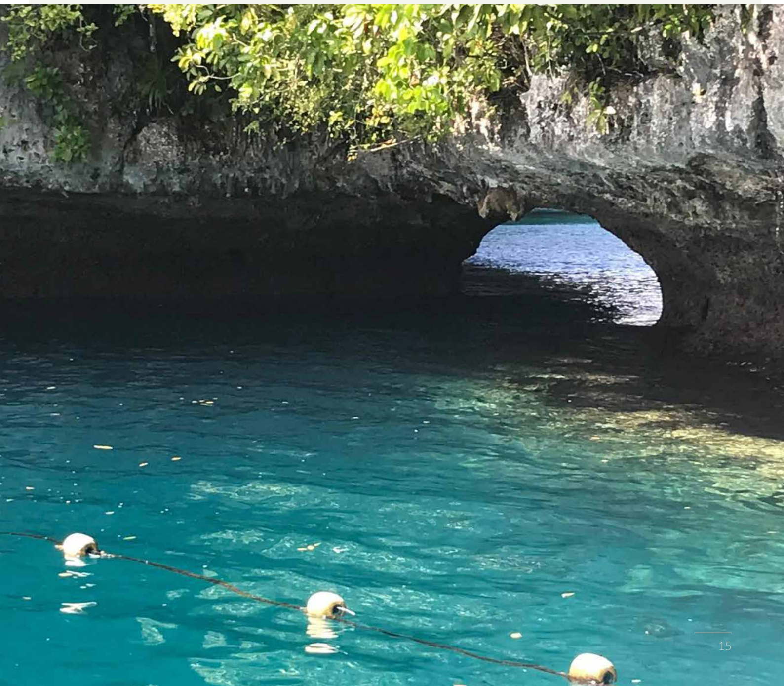
Below: Marine Conservation Area, Palau.