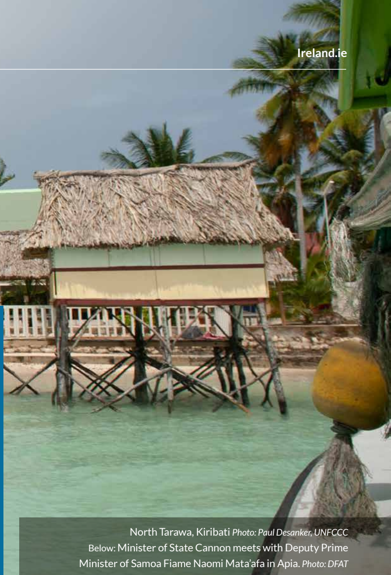
North Tarawa, Kiribati

Ireland has been putting forward a strong case for this support to continue and be enhanced, including through the negotiations on the Post-Cotonou agreement between the EU and Africa, Caribbean and Pacific (ACP) – an agreement which represents more than half of all UN member countries and unites over 1.5 billion people. We have also been playing an active role in ensuring that the draft regulations that will govern the forthcoming EU budget from 2021-27, the Multiannual Financial Framework (MFF), adequately integrate SIDS in terms of geographic focus, targeting and eligibility. The Neighbourhood, Development and International Cooperation Instrument (NDICI) within the MFF will see a proposed investment by the EU of €89.2 billion over the 2021-27 period - financing the EU's external engagement in support of the SDGs. It is important therefore that the regulations provide for investment in SIDS across the Pacific, the Caribbean and Africa in order to support the tackling of economic and environmental vulnerabilities, including climate change, natural disasters and other challenges. Interventions from Ireland at crucial stages of the process in this regard have been helpful.