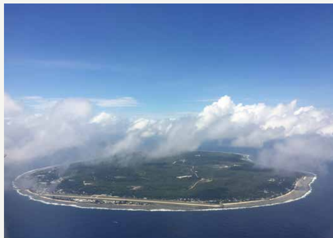
Above: Aerial view of Nauru.